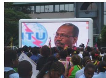
ITU Secretary General, Dr Hamadoun I. Toure