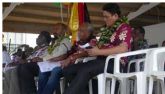
Hon. Meltek Sato KILMAN LIVTUNVANU (MP), Prime

The World Telecommunication and Information Society Day (WTISD) is celebrated each year to mark the anniversary of the signature of the first International Convention in 1865 which led to the creation of the International Telecommunication Union (ITU).