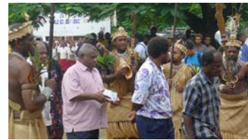
The marchers are welcomed at the stage by the Nakarwai Cultural Group

The Honourable Prime Minister decided to use the event to raise the level of knowledge of Information and Communications Technology (ICT) to everyone. 30 organisations participated demonstrating their products and services with applications clearly useful to every man, woman and child.