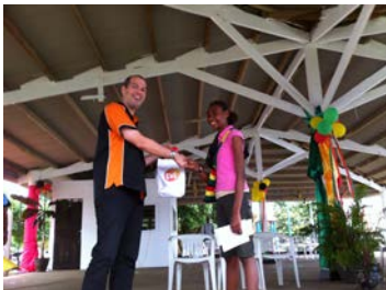
TVL awarding a phone to one of the prize winners