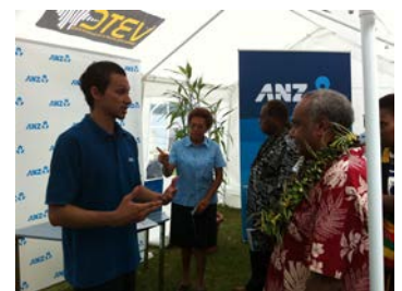
The Prime Minister receiving an explanation of eBanking from an ANZ Official