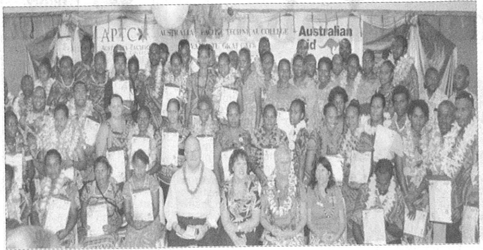
The Australia-Pacific Pacific Islands Technical College (APTC)...