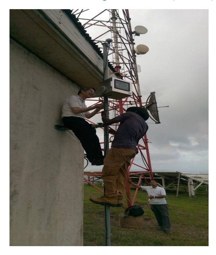
Figure 4 Final Camera Installation Hill552 Tanna