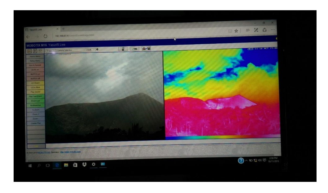
Figure 3 Screen shot of Mt Yasur Camera Images from Ianeula School, Whitesands, Tanna