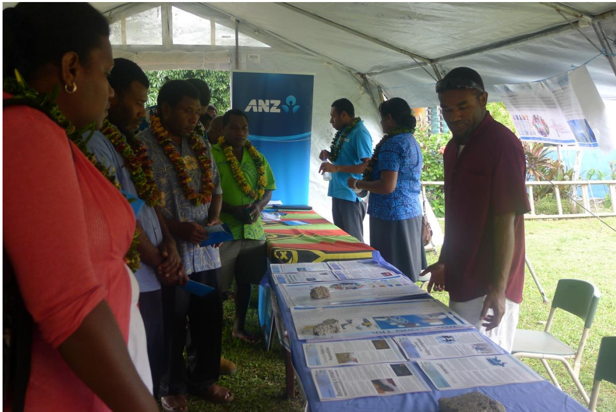
(Official Guest taking a booth tour in Tanna)

For the very first time, the same celebration took place in Tanna and was another successful event. Over 300 people have attended this important celebration.