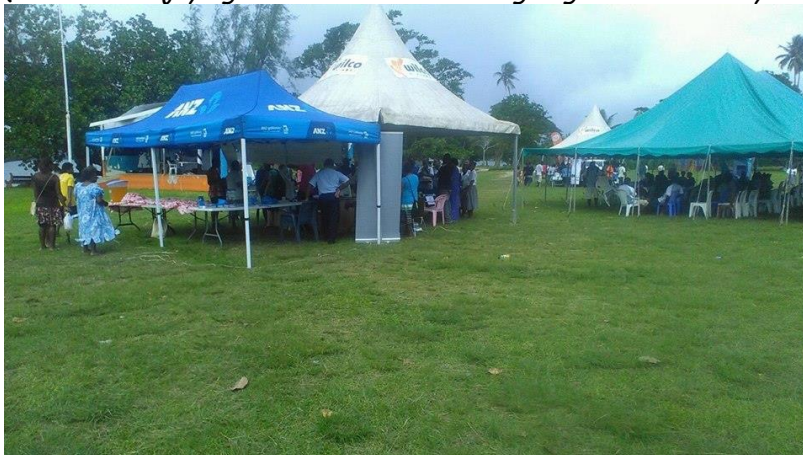
(Audience enjoying the booth tours during Luganville ICT Day celebrations 17 May, 2017)