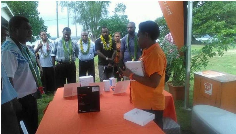
(Luganville Mayor leading booth tour visiting TVL's booth)

The Video from the ITU Secretary General was also presented to audience for the day.